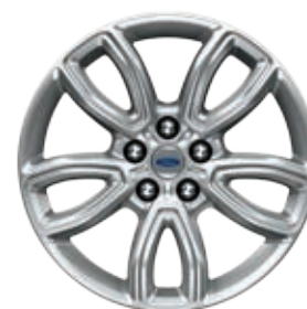
18" PAINTED ALUMINUM Standard

Colors are representative only. See your dealer for actual paint/trim options. 1. Restrictions apply. 2. Always wear your safety belt and secure children in the rear seat. 3. Additional charge.