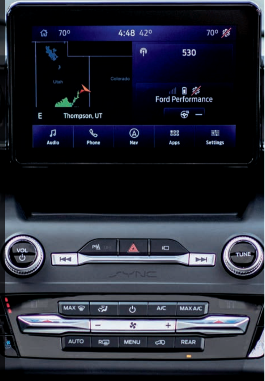
U.S. model shown. Screen display varies by market.

Android Auto and Google are trademarks of Google Inc. Apple CarPlay and Siri are trademarks of Apple Inc., registered in the U.S. and other countries.