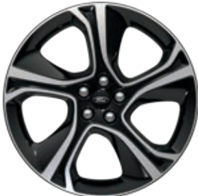
20" Bright-Machined Aluminum with High-Gloss Black-Painted Pockets Standard on ST