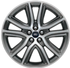
20" Bright-Machined Aluminum with Premium Dark Stainless-Painted Pockets Optional on Titanium