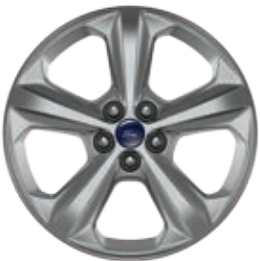
18" Sparkle Silver-Painted Aluminum Standard on SE

Colors are representative only. See your dealer for actual paint/trim options.