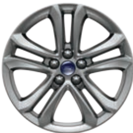
18" Split-Spoke Sparkle Silver-Painted Aluminum Standard on SEL Optional on SE