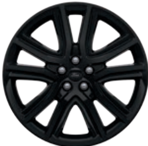
20" Premium Gloss Black-Painted Aluminum Standard on ST-Line