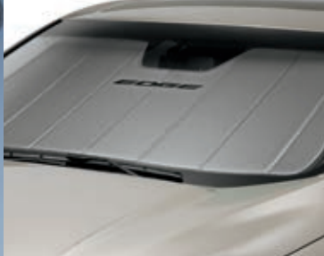
Custom UVS100 Sunscreen 2

We want your Ford Edge® ownership experience to be the best it can be. Under this warranty, your new vehicle comes with 3-year/36,000-mile bumper-to-bumper coverage, 5-year/60,000-mile Powertrain Warranty coverage, 5-year/60,000-mile safety restraint coverage, and 5-year/unlimited-mile corrosion perforation (aluminum panels do not require perforation) coverage – all with no deductible. Please ask your Ford Dealer for a copy of this limited warranty.