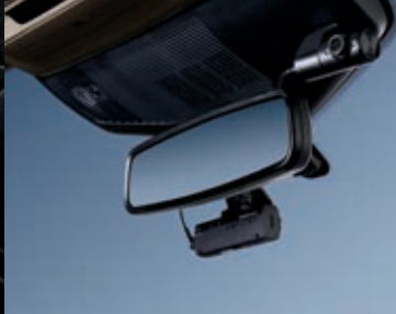
Dash cam systems 2