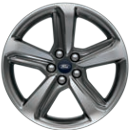
18" Bright-Machined Aluminum with Premium Dark Stainless-Painted Pockets Optional on SEL