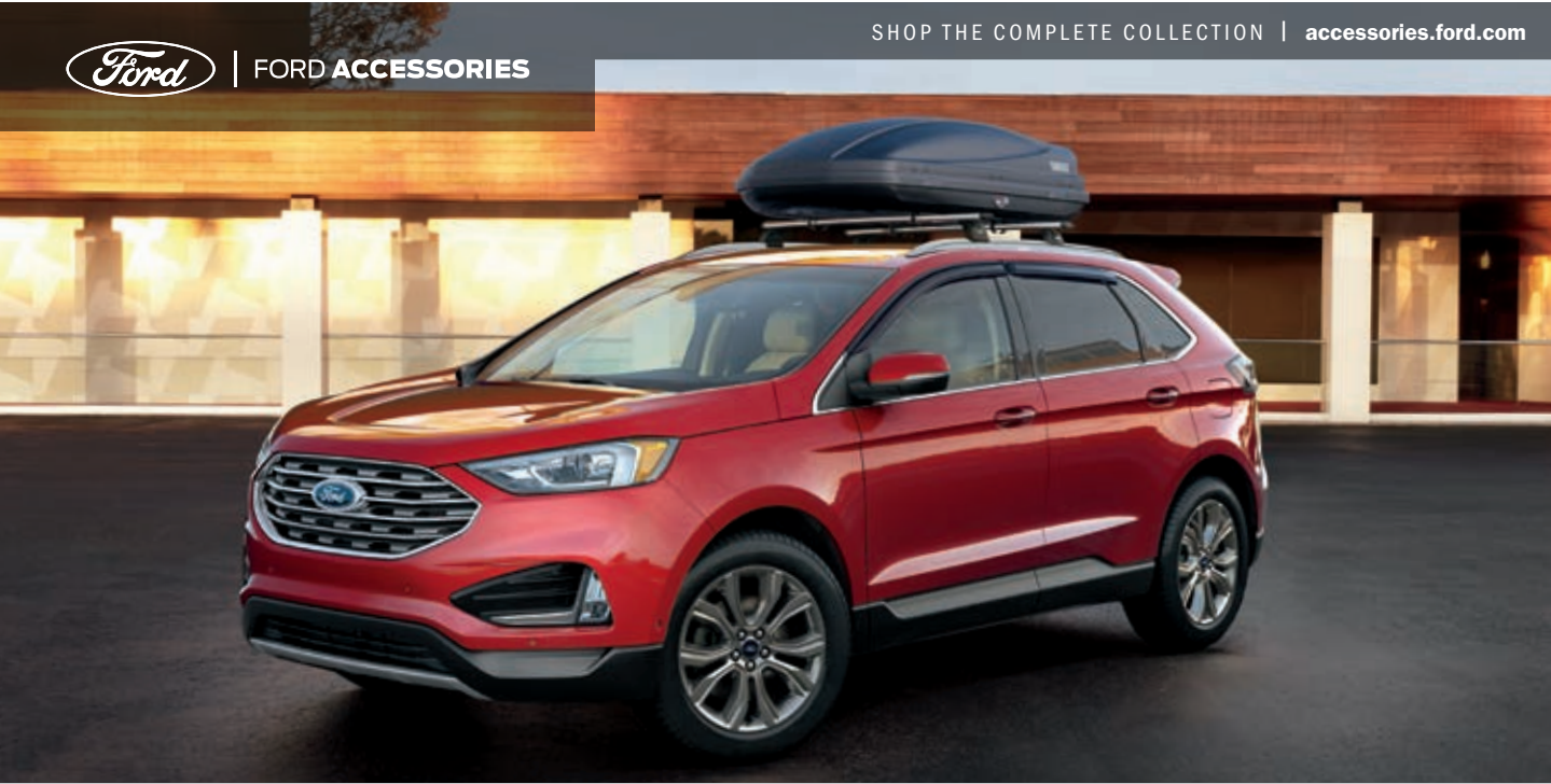
Titanium in Rapid Red MetallicTinted Clearcoat 1 accessorized with smoked side window deflectors, 2 front and rear molded splash guards, roof-mounted crossbars, 3 cargo box, 2,3 and wheel lock kit