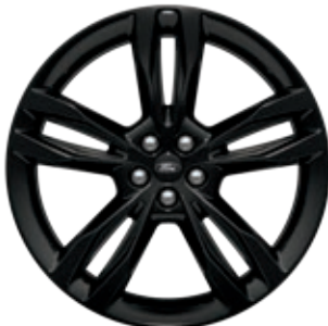
21" Premium Gloss Black-Painted Aluminum Optional; Included with ST Performance Brake Package