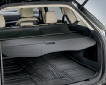
Cargo area protector and cargo cover