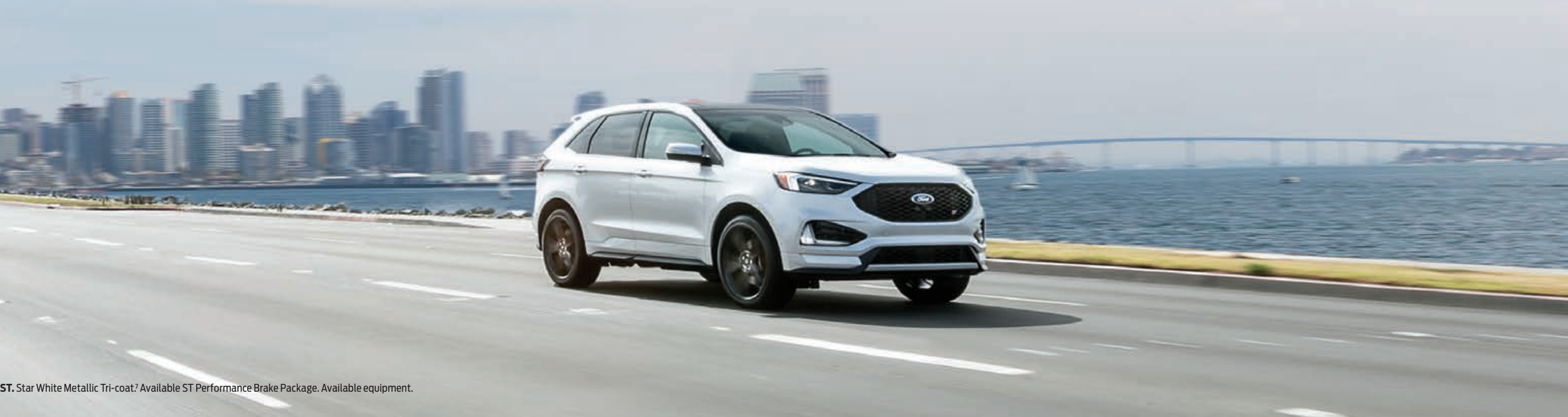
ST. Star White Metallic Tri-coat.⁷ Available ST Performance Brake Package. Available equipment.

1. Navigation services requires SYNC® 4 and FordPass™ Connect, complimentary Connected Service and the FordPass App (see FordPass Terms for details). Eligible vehicles receive a complimentary 3-year trial of navigation services that begins on the new vehicle warranty start date. Customers must unlock the navigation service trial by activating the eligible vehicle with a FordPass member account. If not subscribed by the end of the complimentary period, the connected navigation service will terminate, and the system will revert to embedded offline navigation. Connected service and features depend on compatible AT&T network availability. Evolving technology/cellular networks/vehicle capability may limit functionality and prevent operation of connected features. FordPass App, compatible with select smartphone platforms, is available via download. Message and data rates may apply. 2. Ford Licensed Accessory. 3. Restrictions may apply. See dealer for details. 4. Do not place additional floor mats or any other covering on top of the original floor mats. 5. Consult owner's manual for details on roof-rack load limits. 6. Ford does not recommend using summer tires when temperatures drop to approximately 45°F (7°C) or below (depending on tire wear and environmental conditions), or in snow/ice conditions. If the vehicle must be driven in these conditions, Ford recommends using all-season or snow tires. 7. Additional charge.