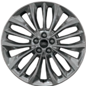
20" Polished Aluminum Included with Titanium Elite Package