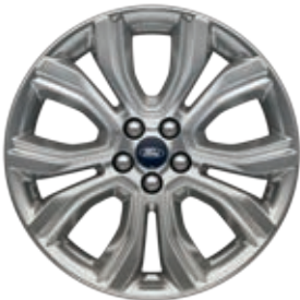
19" Luster Nickel-Painted Aluminum Standard on Titanium